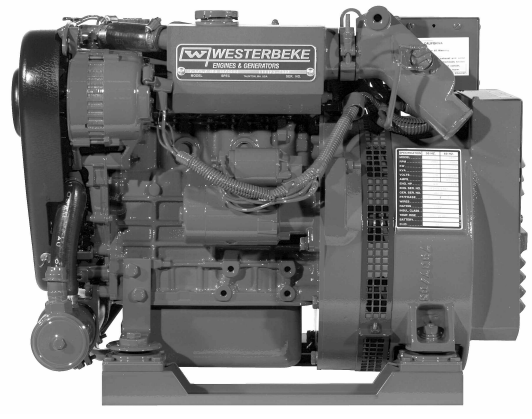
7.6/5.7 BTD Diesel Generator